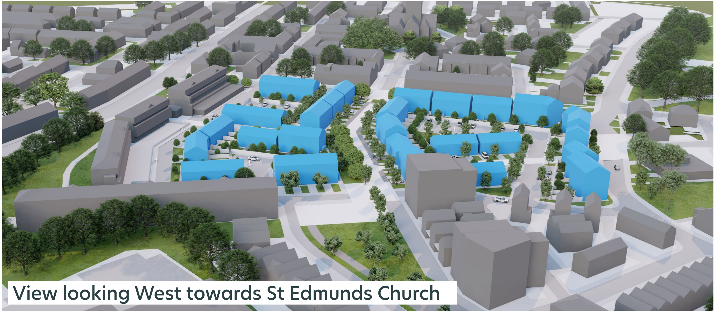
View looking West towards St Edmunds Church