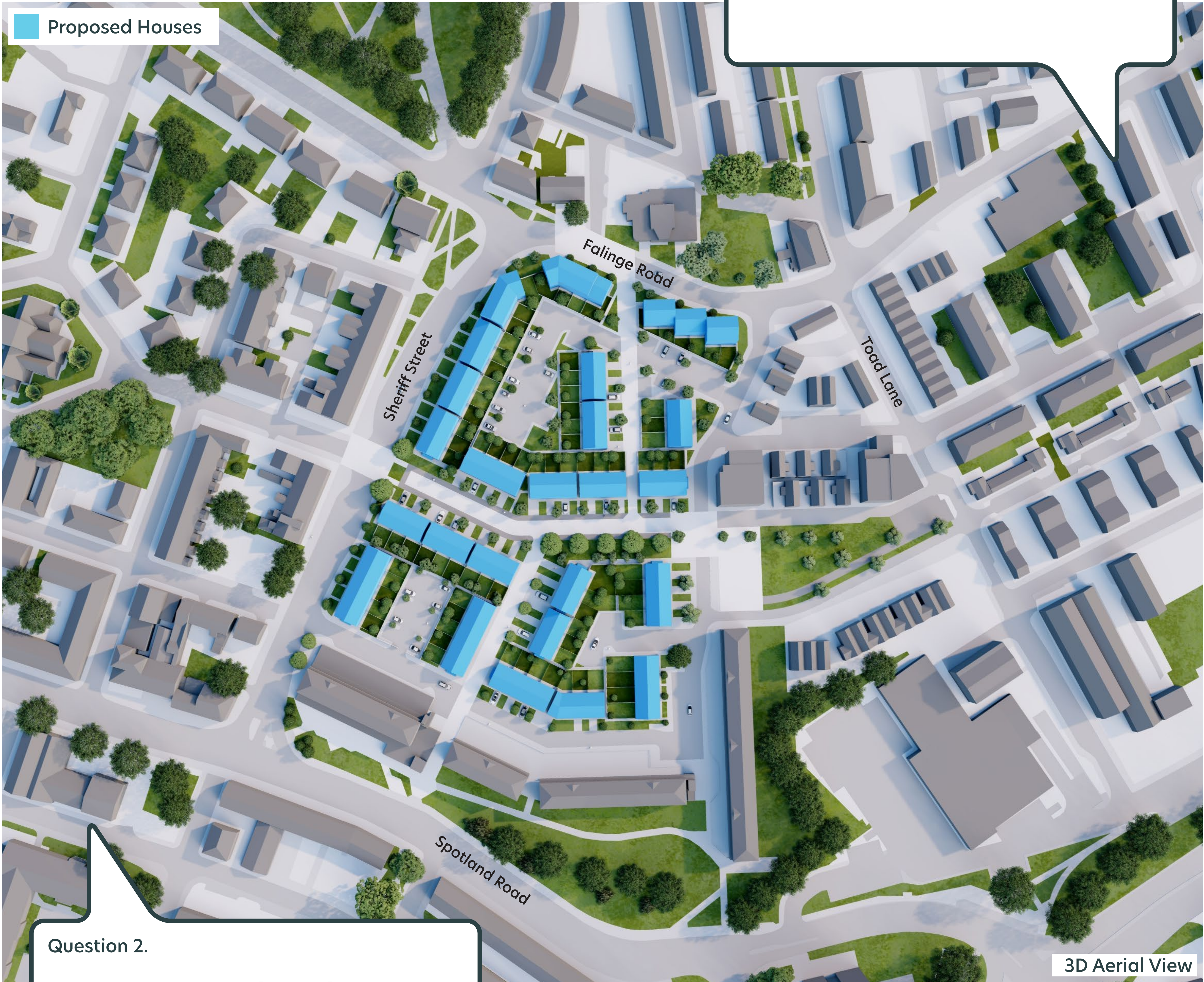
3D Aerial View