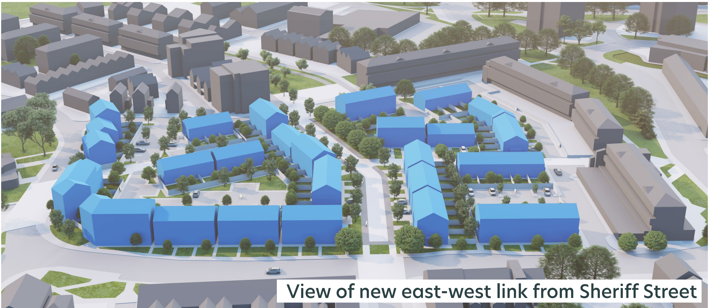
View of new east-west link from Sheriff Street